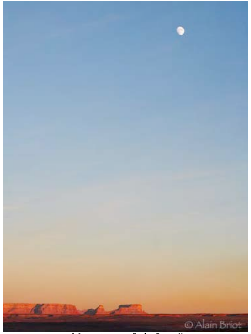
Moonrise over Lake Powell