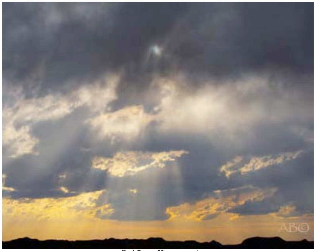
Part III The Environment